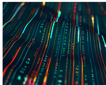
Fast and secure access to work information