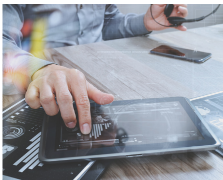
Management and security of employees' work devices

Installing MDM software blocks the use of unwanted applications on company devices and ensures fast and secure access to work information.