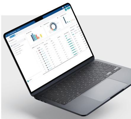
Centralized data administration