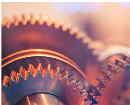
Maintenance and configuration of phones and laptops