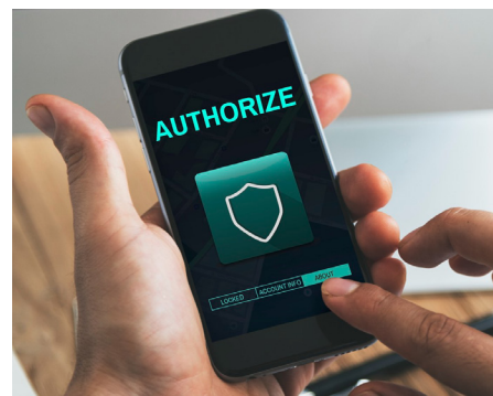
Protection against external interference